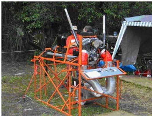
HARLEY DAVIDSON PUSHER

Interesting engines were run on test stands. A Harley with pusher prop roared mightily and thrashed the downstream vegetation impressively. A blower ducted cooling air to each of the two cylinders for ground running. A small turbine and automotive conversions were also demonstrated. They were near the crafts tents where you could learn welding, fabric work, engine work, wood fabrication, composites, wiring, etc.