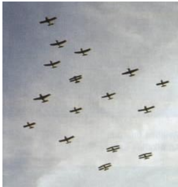
SPRUCE CREEK FORMATION

On Saturday, as we were readying to leave Spruce Creek, many groups of similar planes gathered and flew away in formations for brunch. This Spruce Creek formation is described in the May 2003 Sport Aviation, Letters to the Editor: