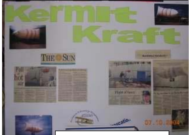
News Articles on the airship