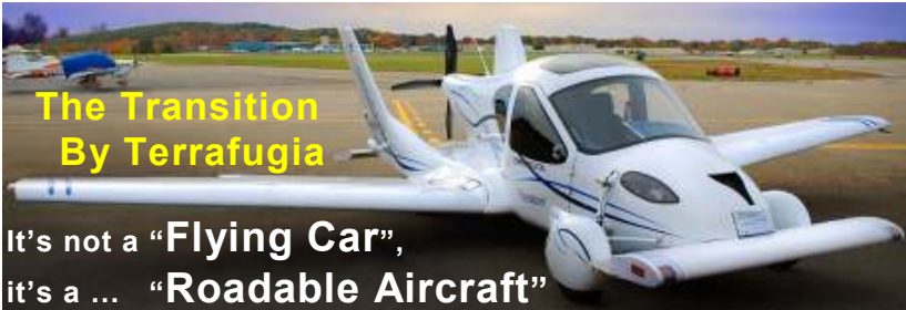
The Transition By Terrafugia