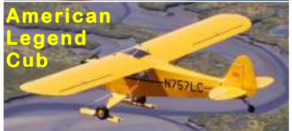
American Legend Cub