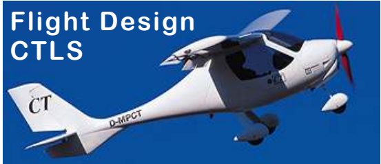
Flight Design CTLS

FREE admission to see & learn about these LSA aircraft (and more!) Organized by: www.EAA106.org